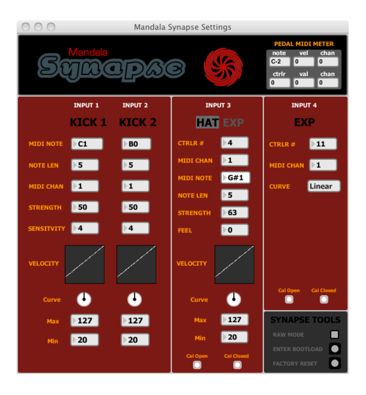
Fig. 2) Synapse Settings main (and only!) window

This section is for the purpose of understanding the parameters of the Synapse software and hardware before connecting your equipment and getting it all running.